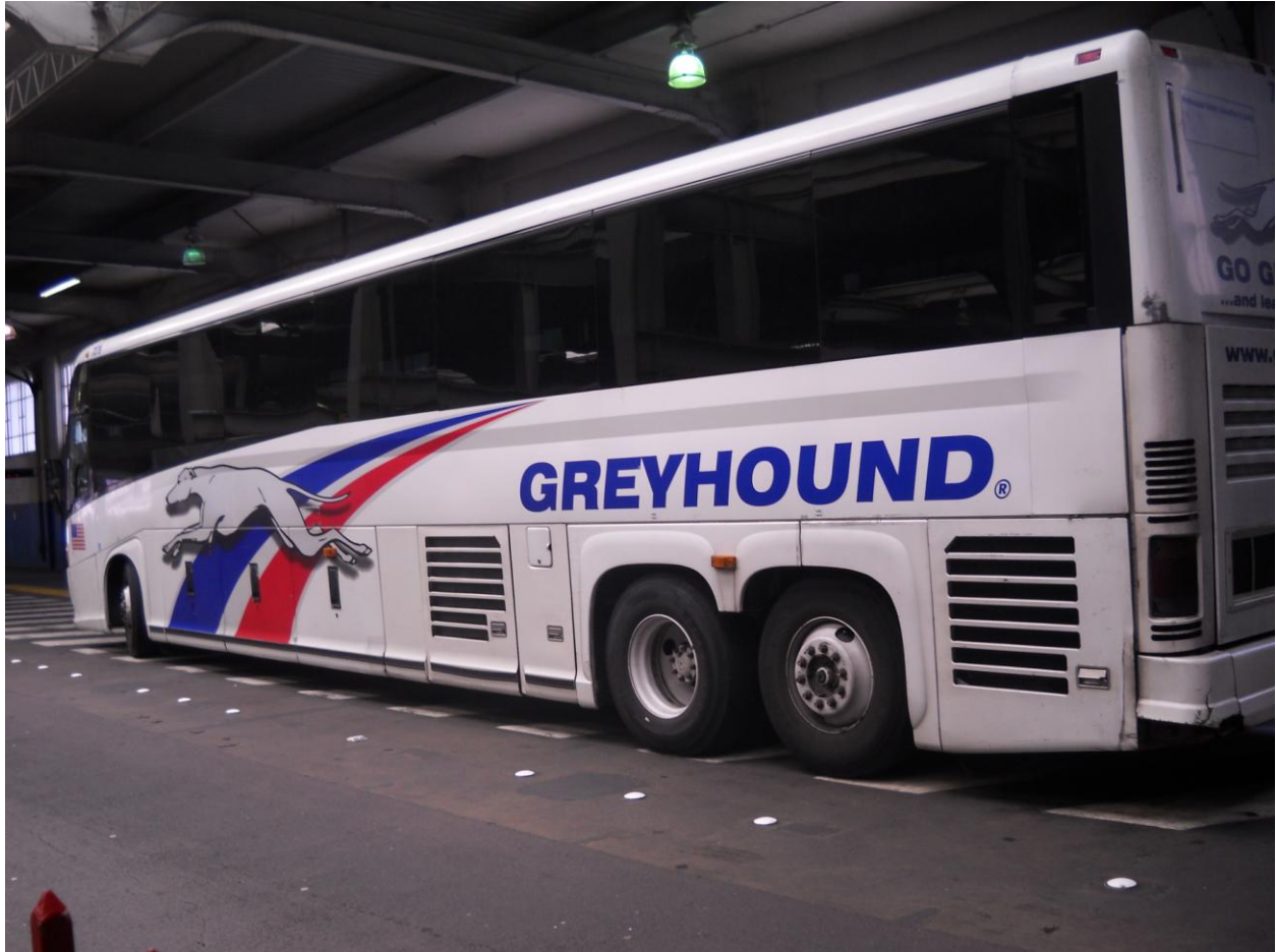
Above: A Greyhound bus parked inside the Transbay Terminal.